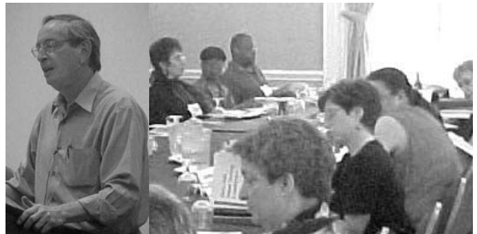
NYSDA Annual Meeting and Conference 2003. More photos p. 35.