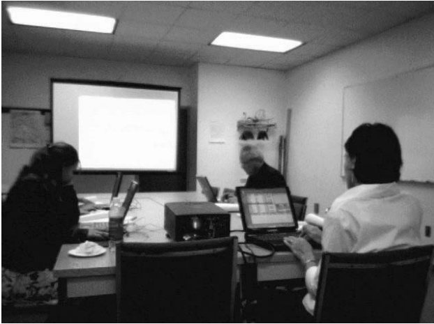
Jefferson County Public Defender staff quickly learn the ins and outs of the PDCMS in training session.